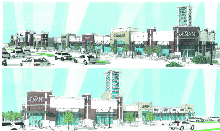
SOONER ROSE - PHASE II - MIDWEST CITY, OK